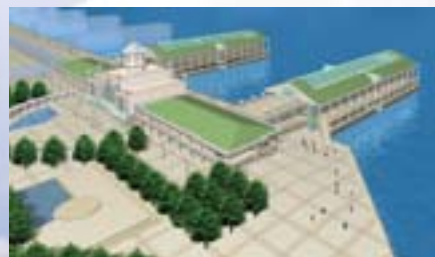
New Star Ferry Pier