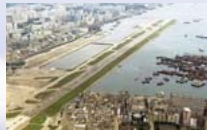
Former Kai Tak Airport