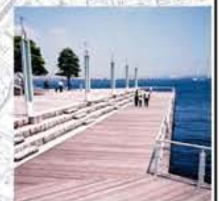
19. Boardwalks will be used to create an interesting edge to the typhoon shelter and marine basin