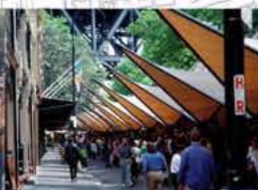
3. Informal street markets will activate the promenade