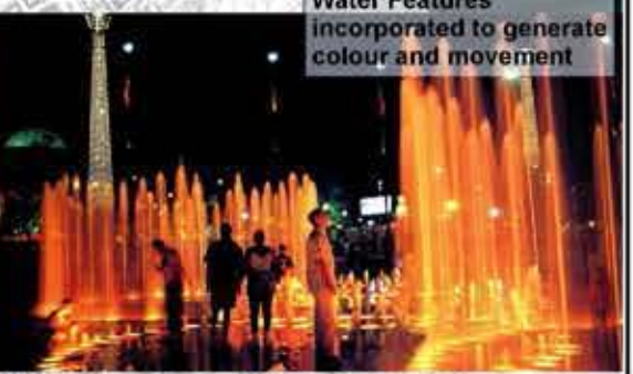
10 and 15. Water Features incorporated to generate colour and movement