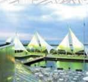
14. Opportunities for waterfront dining and recreation will be created by the opening up of the harbour edge