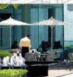
14. Opportunities for waterfront dining and recreation will be created by the opening up of the harbour edge