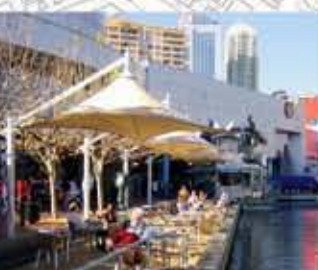
14. Opportunities for waterfront dining and recreation will be created by the opening up of the harbour edge