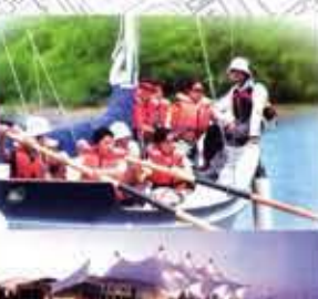
18. Facility at the harbour front for promoting water sports and recreational activities