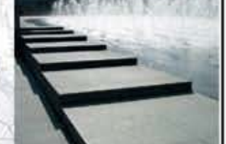
10 and 15. Water Features incorporated to generate colour and movement