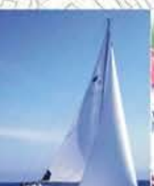
18. Facility at the harbour front for promoting water sports and recreational activities