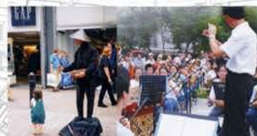
3. Informal outdoor performance areas will provide activities at the waterfront