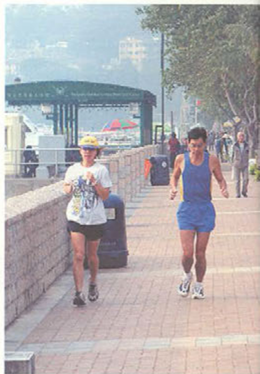
西貢海傍 Sai Kung Waterfront