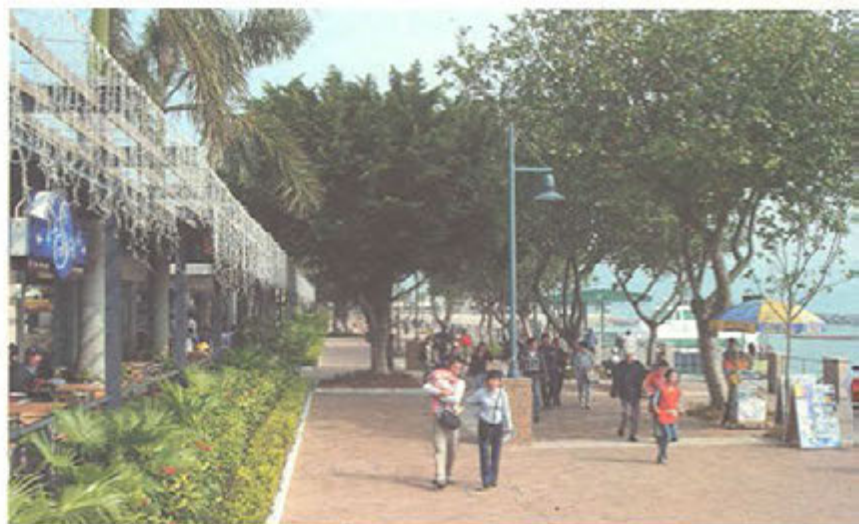
西貢海傍 Sai Kung Waterfront